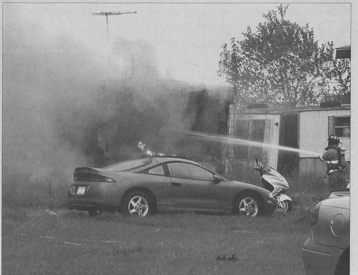
Firefighters were called to the 1000 block of Campo Rosa Road to battle a trailer fire around 8:20 a.m. Sunday. No injuries were reported and an investigation indicated that the fire started when a cat knocked over a lit candle inside the trailer.

Because El Campo is the financial administrator for the Continued on page A12